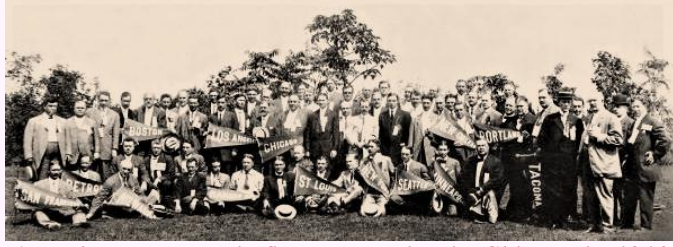
Attendees at Rotary's first convention in Chicago in 1910. Rotary's first fiscal year began the day after the convention ended.

Ever wonder why 1 July is the beginning of the Rotary year? Initially, our conventions played a key role in determining the start date of our fiscal and administrative year.